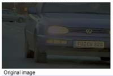
Real time night vision mode (ALL)

The real time night vision mode (automatic low light) allows higher sensitivity in real time without motion blur. This mode excels for surveillance of areas with low lighting. The all-time sensitivity combined with low-speed shutter and ALL helps to save costs for light and energy.